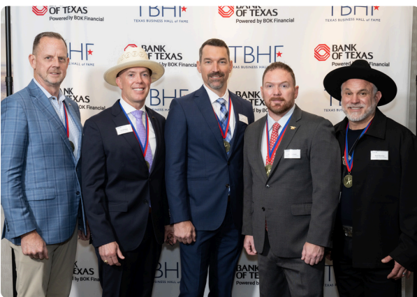
The 2025 Future Texas Legend Veteran Honorees.