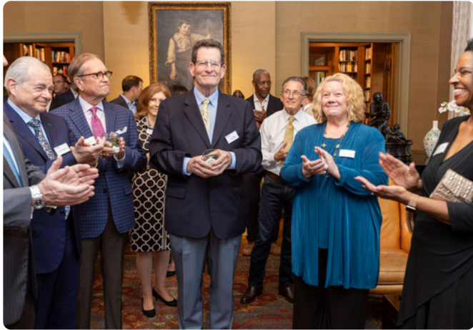
Guests congratulated Ken Fisher on his 2025 Hall of Fame Induction at the Dallas gathering.