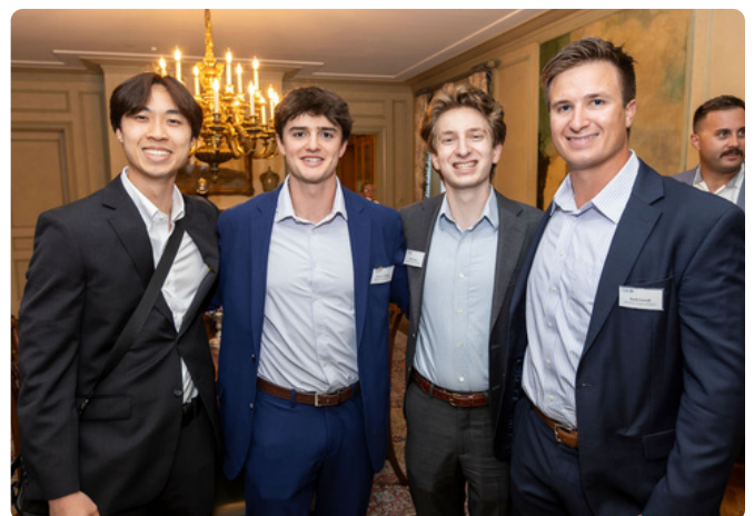
Dallas-area Future Texas Business Legend Award Recipients.