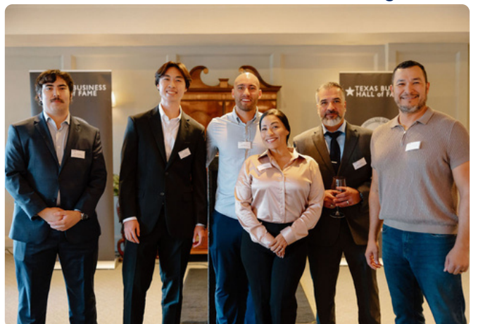
Award Recipients from 2024 and 2025.