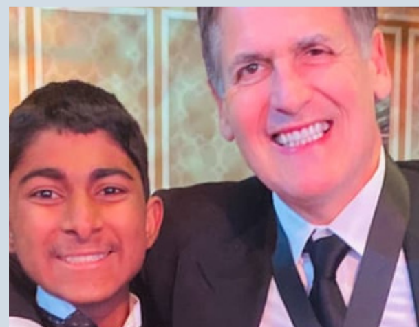
With TBHF Legend Mark Cuban (Dallas Mavericks) at the 2021 Induction Dinner in Dallas