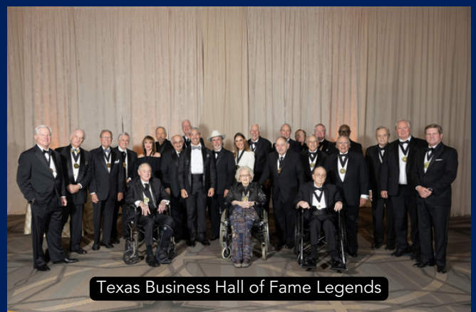
Texas Business Hall of Fame Legends