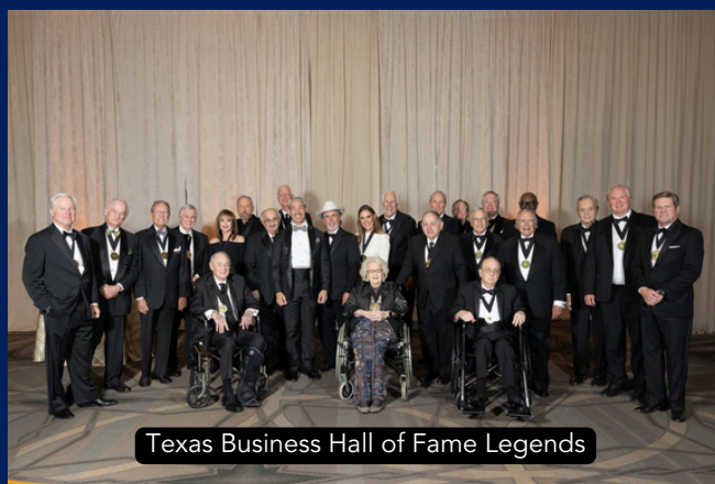
Texas Business Hall of Fame Legends