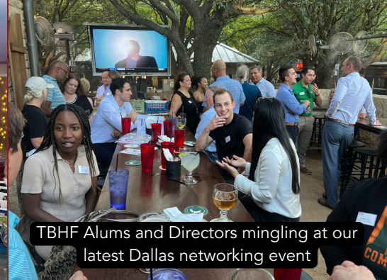
TBHF Alums and Directors mingling at our latest Dallas networking event