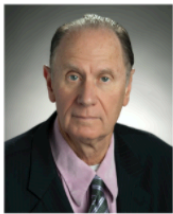
David Bonderman TPG Capital