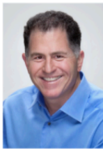
Michael Dell Dell