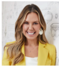
Kendra Scott Kendra Scott, LLC