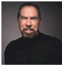
John Paul DeJoria Paul Mitchell & The Patrón Spirits Company