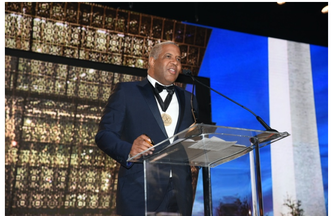
Robert F. Smith's Acceptance Speech at 2019 Induction

The Texas Business Hall of Fame made the decision to move its 38th annual induction event to October 28, 2021, at the Hilton Anatole in Dallas. We look forward to honoring the six inductees selected in 2020 and will not be naming a separate inductee class for 2021. Please make plans to join this in-person celebration next fall.