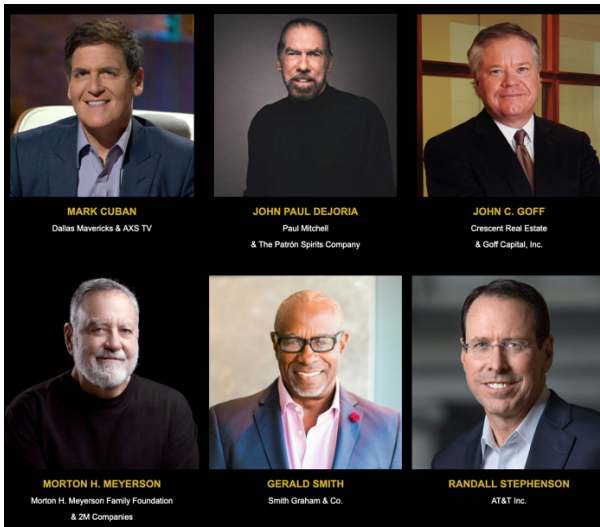
38th Annual Class of TBHF Legends

In early 2020, we announced six Legends for induction into the 38th Annual Hall of Fame. These leaders represent a lifetime of entrepreneurship, innovation and service to their industries, communities and world.