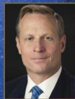
ROSS PEROT, JR. DALLAS